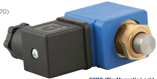
S9110 (Big Magnetic Lock)